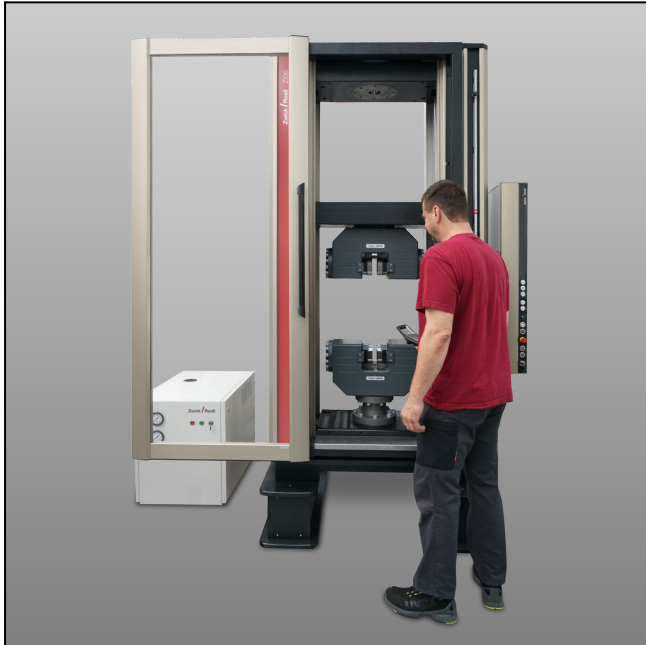
Z330E with hydraulic grips