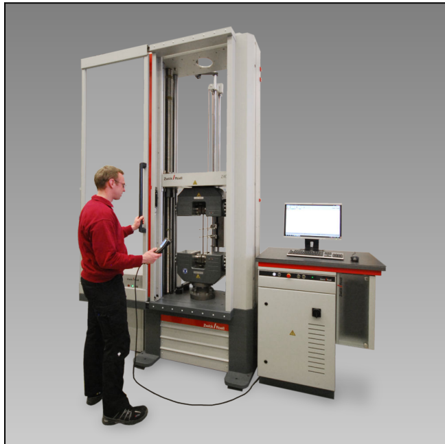
Z400E with hydraulic grips