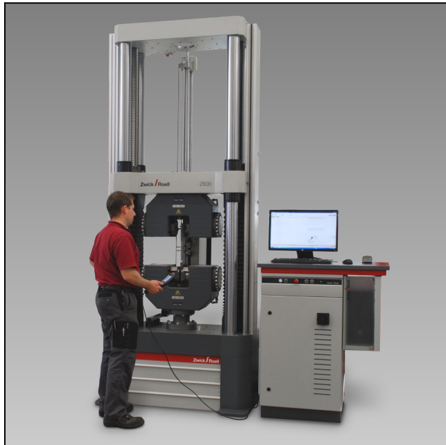
Z600E with hydraulic grips