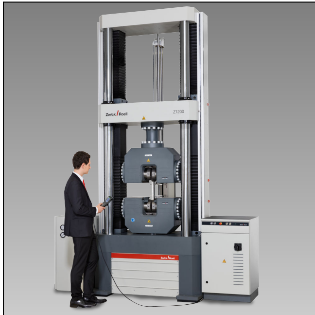
Z1200E with hydraulic grips