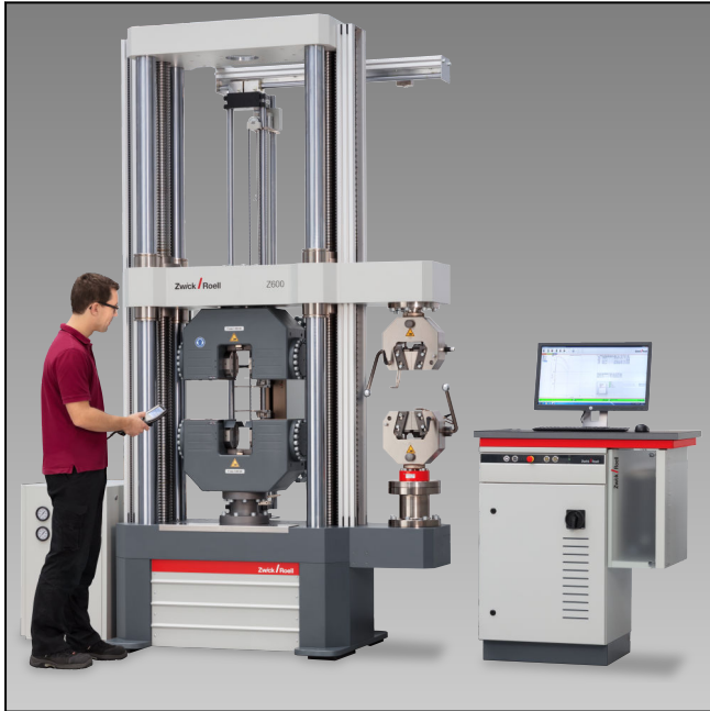
Z600ES with hydraulic grips