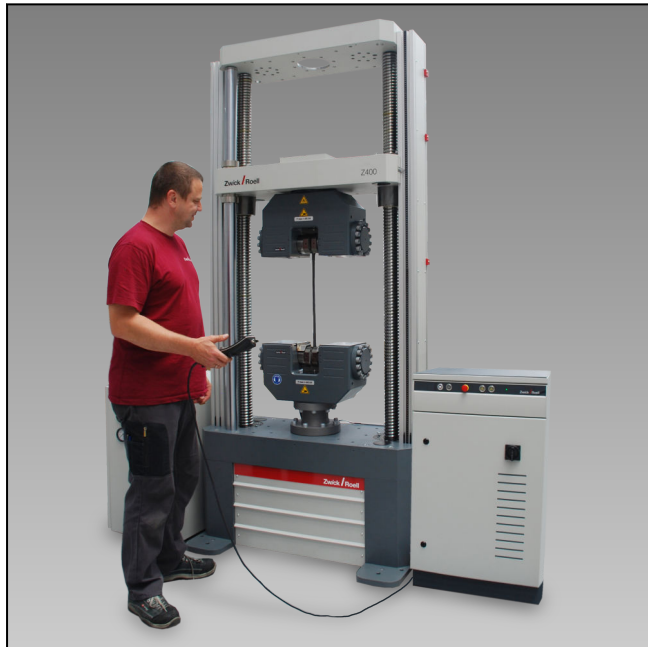
Z400RED with hydraulic grips