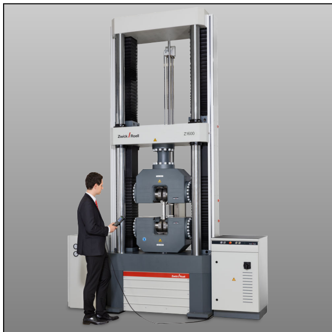
Z1600E with hydraulic grips