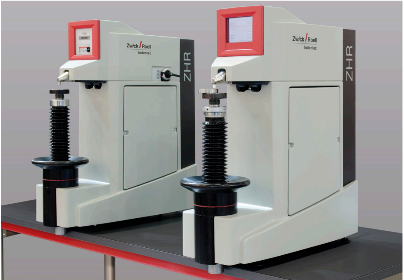
Hardness tester ZHR4150AK