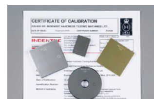
Hardness comparison plate with certificate