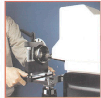
Preparation to measure inside of a gear box part